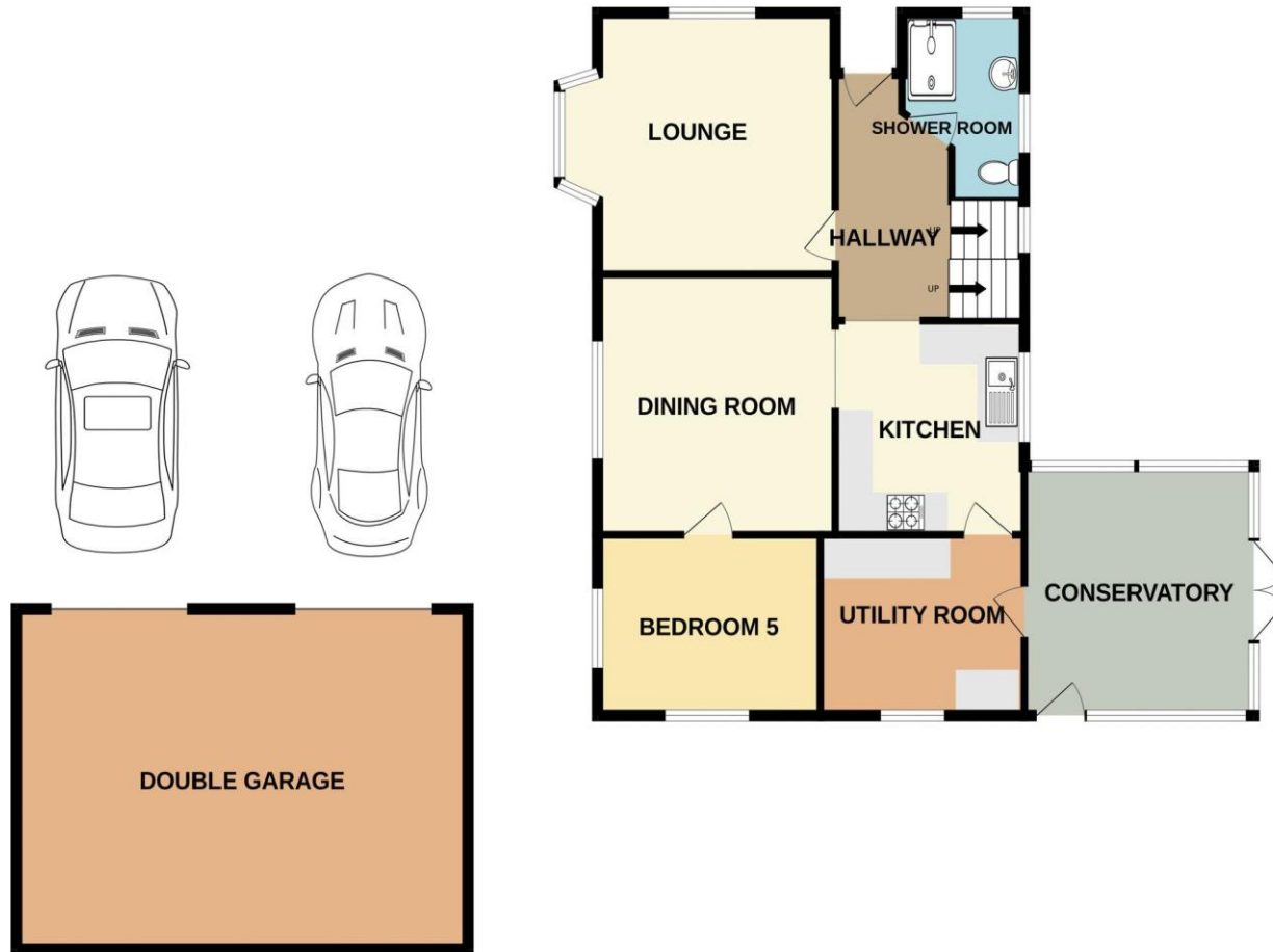
GROUND FLOOR 1323 sq.ft. (122.9 sq.m.) approx.